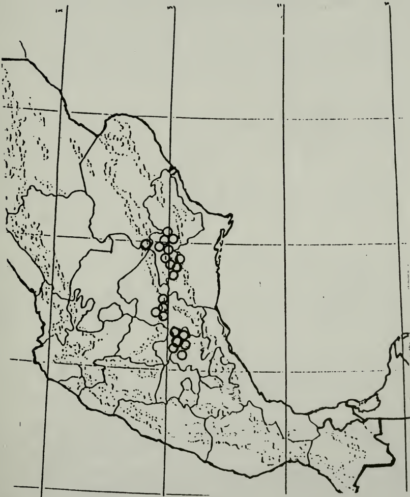
Figure 2. Distribution of Rhus pachyrrhachis (open circles).